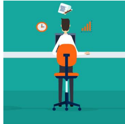
1 | User starts quiz