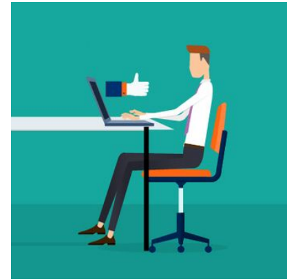
3 | Quiz time extended automatically