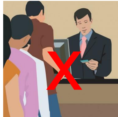
No need to create user-overrides