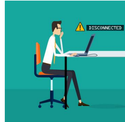
2 | Time lost due to network problem